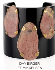
DAY BIRGER ET MIKKELSEN